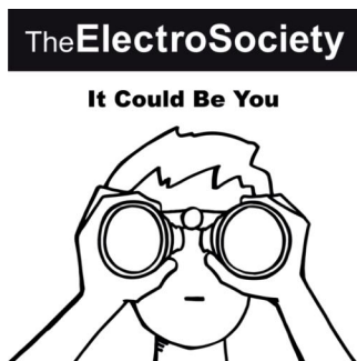
It Could Be You Single 2019