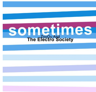
Sometimes Single 2017