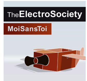
Moi Sans Toi Single 2019